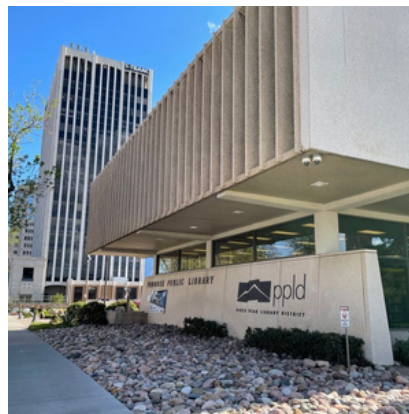
Penrose Public Library: Pikes Peak Library District

This project addresses a critical gap in accessibility at PPLD. These speakers deliver clear visual alerts alongside audible announcements to ensure effective communication for all library patrons.