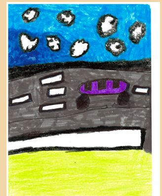
Selections of art by students of the Colorado School for the Deaf and Blind created through the Experiential Arts Collaboration Program.