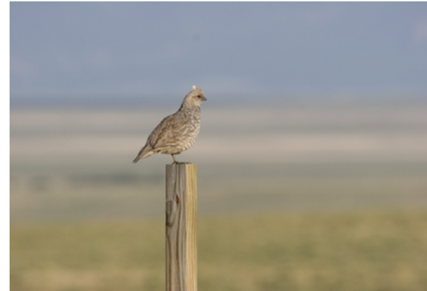
Scaled Quail perched above the Bohart Ranch praries.

With PPCF's support, the SOAR Coalition the SOAR Coalition successfully acquired 12,000 acres from the State Land Board for the Bohart Ranch project.