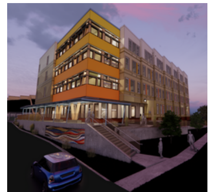
The Launchpad: Cohen-Esrey Development Group

In 2023, The Place broke ground on The Launchpad. This apartment community is designed to help transition youth and young adults out of homelessness and into stability.